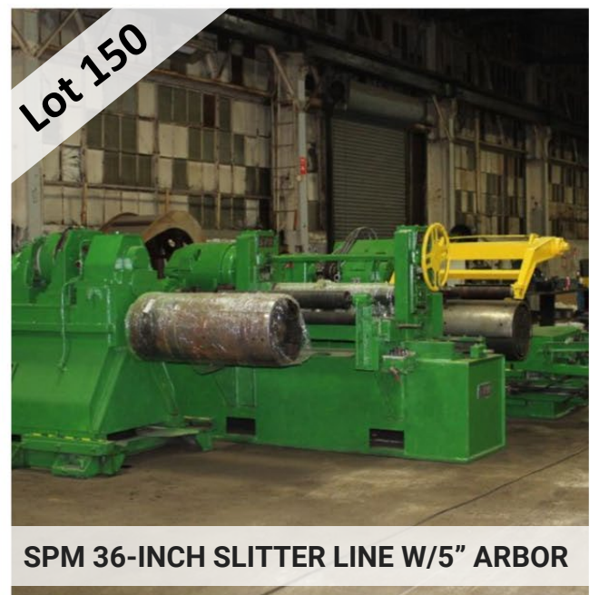
SPM 36-INCH SLITTER LINE W/5" ARBOR