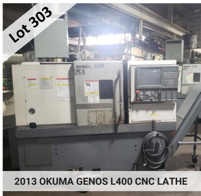
2013 OKUMA GENOS L400 CNC LATHE