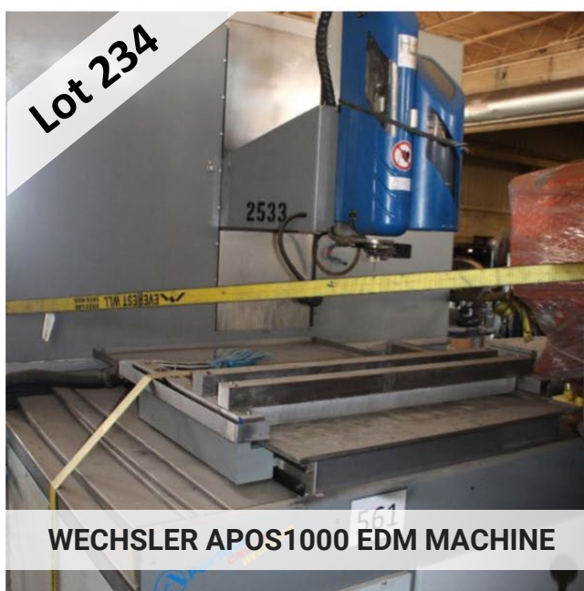
WECHSLER APOS1000 EDM MACHINE