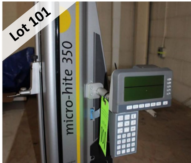
BROWN & SHARPE MICRO-HITE 350