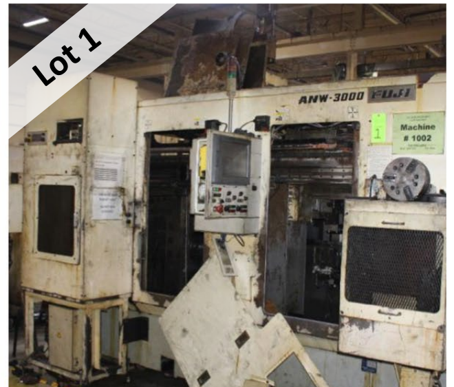
FUJI ANW-3000 CNC MACHINE