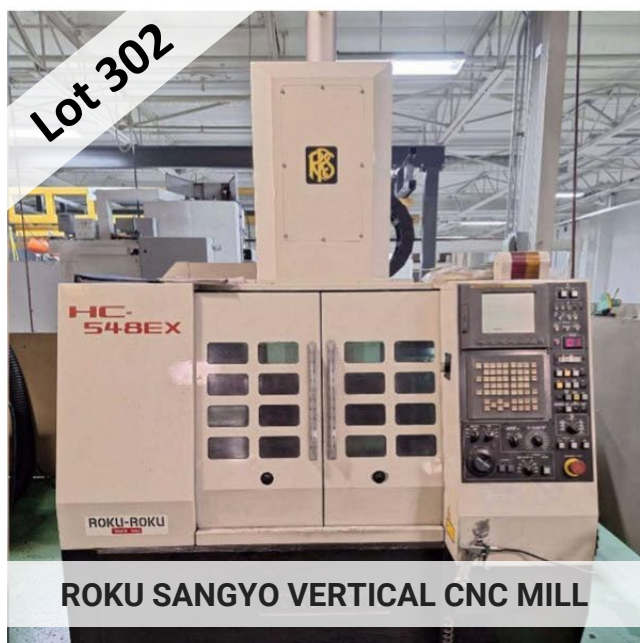
ROKU SANGYO VERTICAL CNC MILL