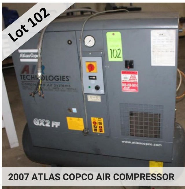
2007 ATLAS COPCO AIR COMPRESSOR