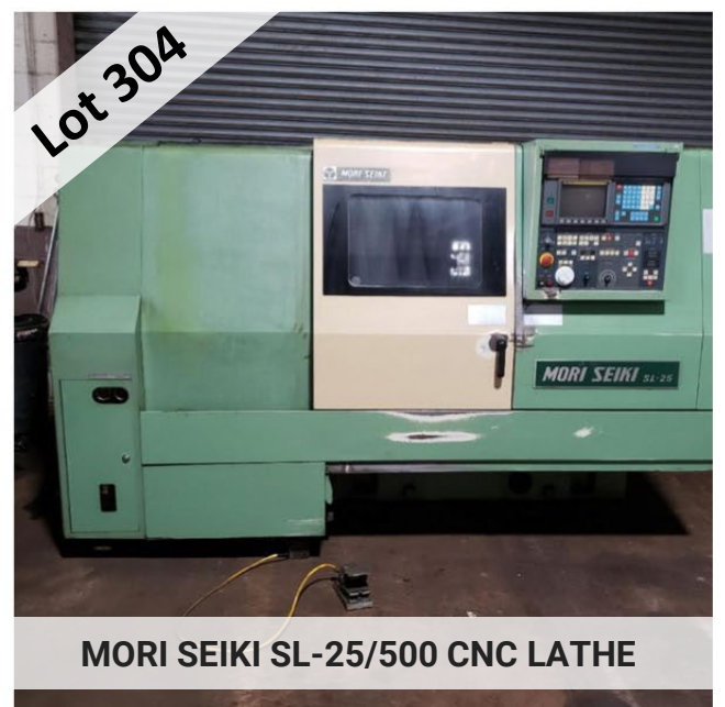
MORI SEIKI SL-25/500 CNC LATHE

Previews to be held on Tuesday 9/19/23 from 8am-4pm by Appointment ONLY! Contact Jamie at (248)602-1980 or accounting@levyrecovery.com to schedule.