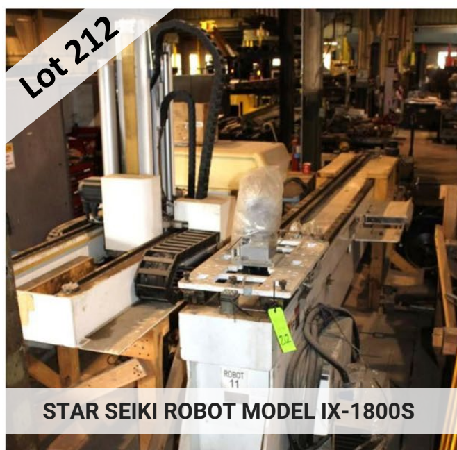
STAR SEIKI ROBOT MODEL IX-1800S