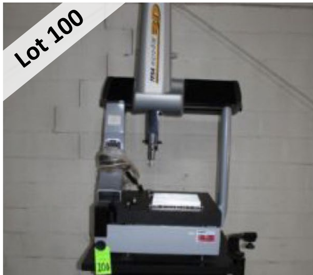
TESA TECHNOLOGY MEASURING MACHINE

Machine Tools, Shop Supplies, Hand Tools, Drill Press, CNC Machines, Air Compressor, Hobbing Machines, Bench Sanders, Radial Drill Presses, Comau Robots, Tool Chests and Much More!