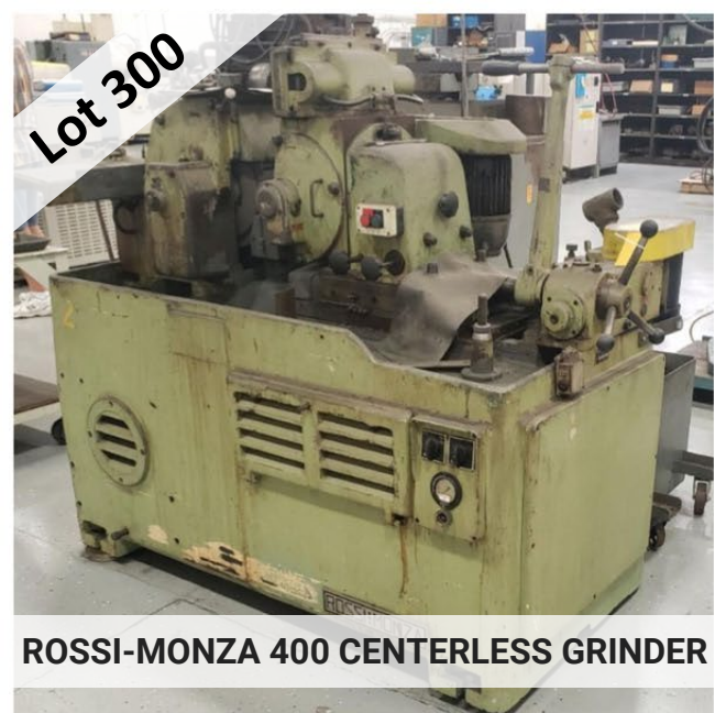
ROSSI-MONZA 400 CENTERLESS GRINDER