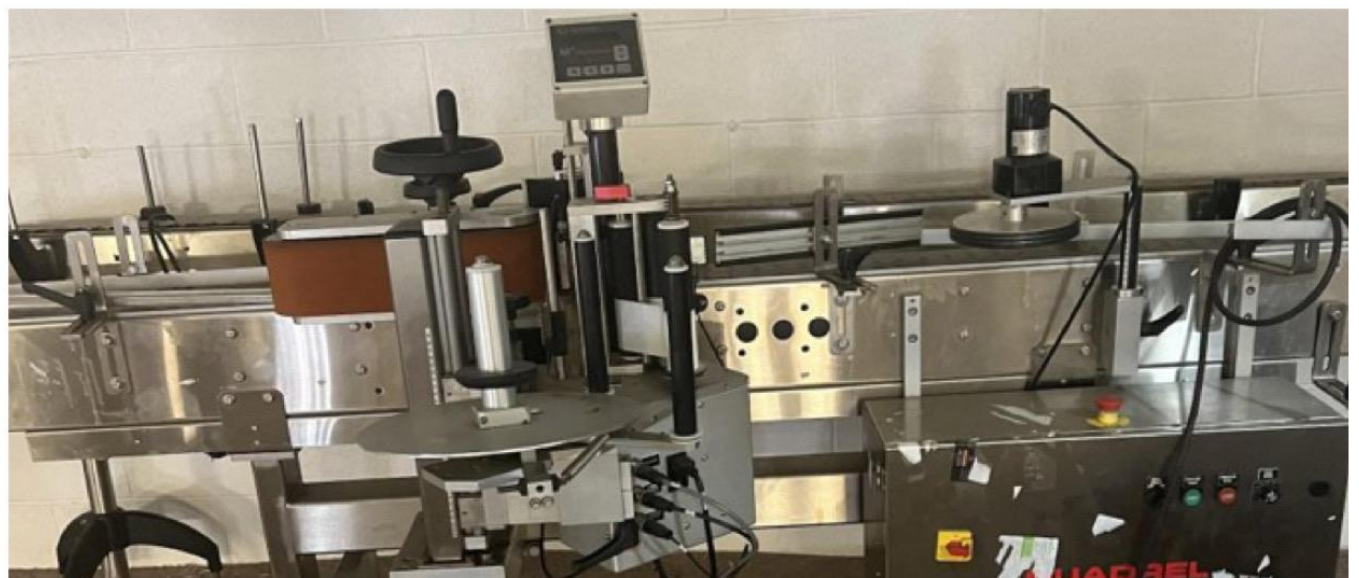
ECONOLINE WRAP LABELING SYSTEM