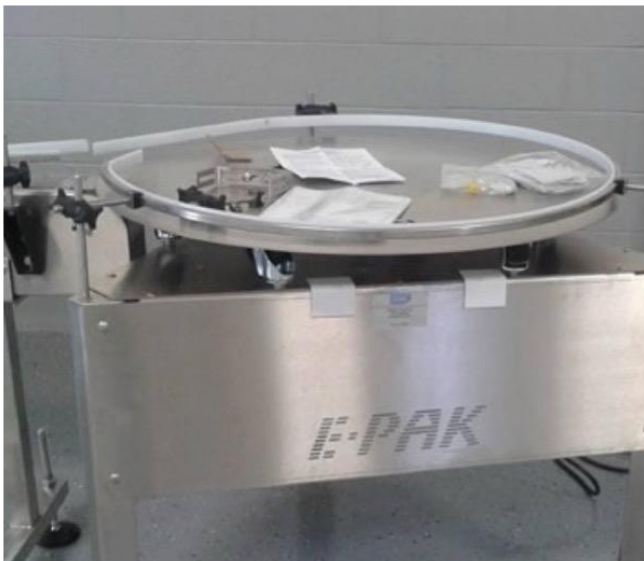
40" 304 STAINLESS STEEL TURNTABLE

Equipment no longer needed for continuing operations at Purolea Cosmetics. All items available now and accepting offers. Contact Jamie at (248) 602-1980 for additional information or to schedule a viewing.