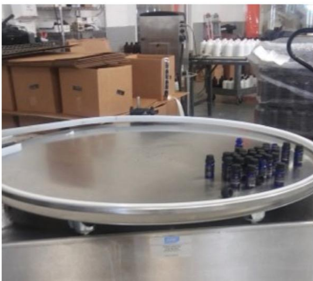
40" 304 STAINLESS STEEL TURNTABLE