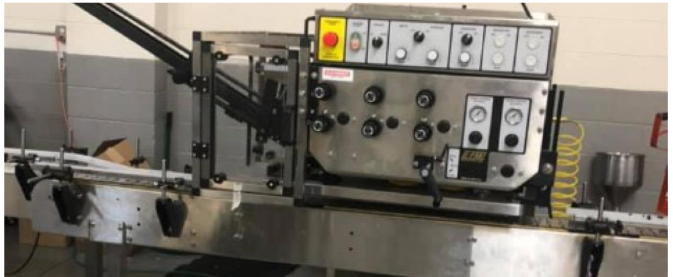
3 STATION SCREW CAP TIGHTENER