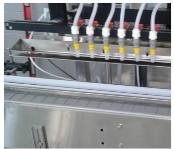
6 HEAD GRAVITY FILLER

Call Jamie at (248)602-1980 to schedule an inspection!