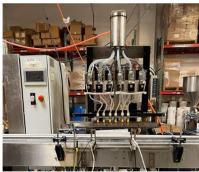
6 HEAD AUTOMATIC GRAVITY FILLER